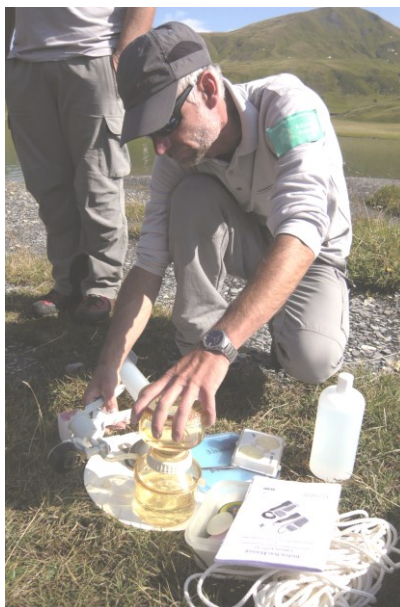
Figure 1: Sampling in lake Anterne by the ranger of the natural reserve (ASTERS).