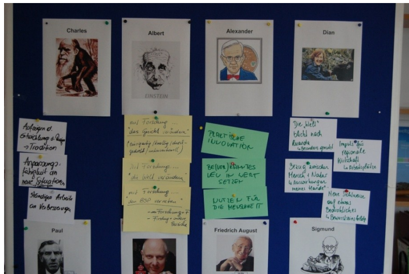
Figure 2: What would these scientists find interesting about the National Park? – Workshop design for the research agenda.

The central questions are answered in specially designed intensive workshops, using partly creative and partly analytical processes (cf. GETZNER et al. 2010) (Figure 2). Different groups can be invited to collaborate depending on the requirements specified by the park management. The research concepts of seven parks are described below.