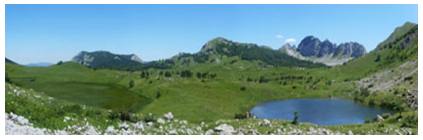
Figure 3: Gornje Bare lake (right on the picture). Next to it is a basin of a dry lake, which has no hydrological function. It is a natural evolutionary sequence without the influence of a human factor