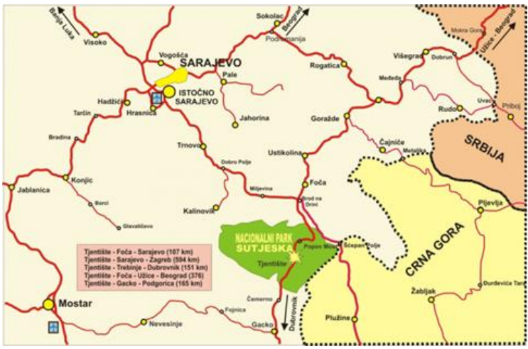
Figure 1: The traffic-geographical position of the National Park 'Sutjeska'

These orographic morphostructures are made of tectonic and orographic vault elevated in the terciary. They are vertically dissected with the surface watercourses of the Drina river basin in the northeast. Zelengora borders with the Sutjeska valley in the southeast and east towards Maglic and Volujak mountains. In the southeast, towards the Treskavica mountain, Zelengora borders with the valley of the river Ljuta. The largest part of Zelengora mountain belongs to the National Park (NP) 'Sutjeska'.