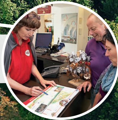
The National Park Centre is the main information and booking point for excursions and tours.