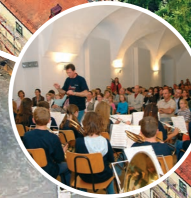
The Event Centre offers ample space for all types of events such as seminars, concerts, parties and even weddings.