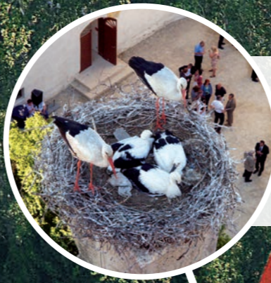
The lookout point on the tower is the ideal place to get to visit the temporary exhibitions and catch a glimpse of storks, jackdaws, kestrels and their nests.