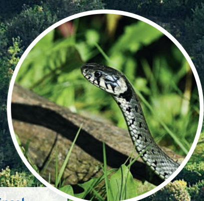
The Schlossinsel showcases the habitats, flora and fauna of the National Park.