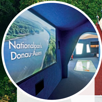
Our lounge offers new perspectives on the National Park.