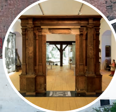
The museumORTH offers interesting information about the history of schlossORTH and life on the river.