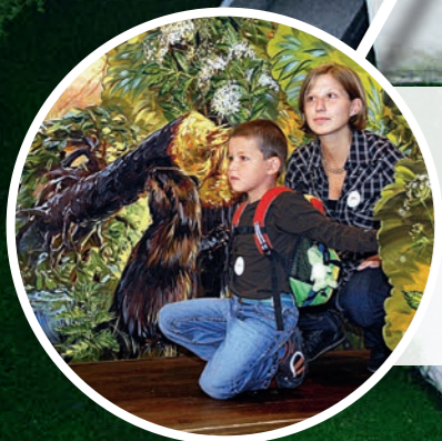
The "DonAURäume" exhibit (note: the exhibit's name is a play on words combining "Danube Spaces" with "Au", the German word for wetlands) will motivate visitors to explore wetlands nature in the National Park.