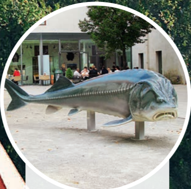
The castle courtyard features a monument in the form of a life-sized sturgeon.