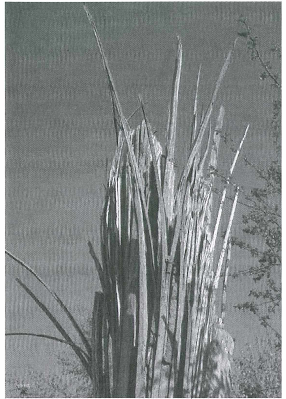
Figure 2: Examples of habitat structures: stem cavities (left) and broken and splintered stem (right).

A detailed description of the methods and the assessed attributes is underway. The data are recorded using FieldMap® software and stored in an ORACLE® database. All information required to understand the sampling is carefully archived to ensure that we and future generations are able to analyze all the gathered data.