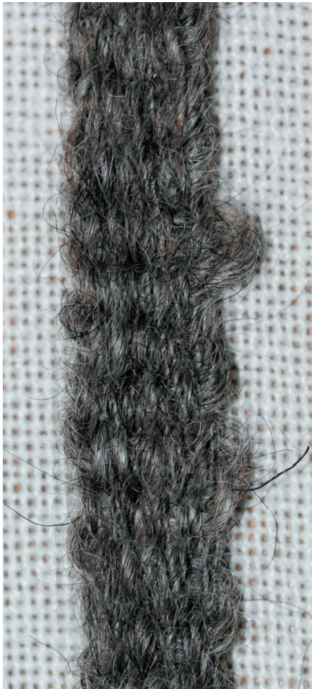
Figure 13. Band woven with heddles, using handspun sheep wool in mixed grey colours.

materials in all aspects. Replicating even a simple textile such as B 1396 and its visual effects is not trivial, as the attempt with similar – but not exactly corresponding – fibres in Figure 13 shows. This means that in some cases, where matching the original materials is not possible for various reasons, it may be impossible to arrive at results that are close to the original item.