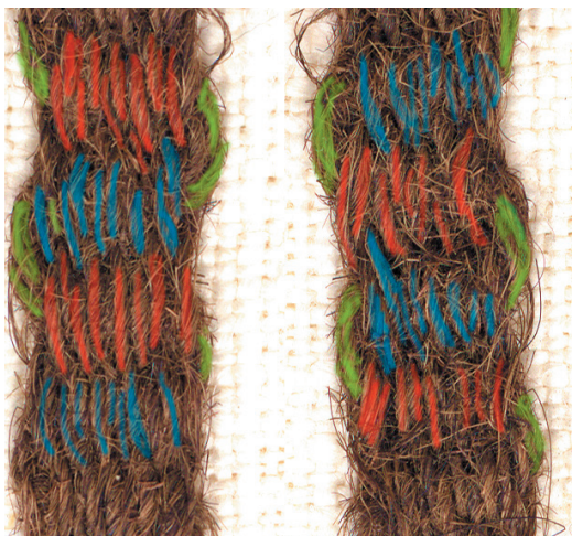
Figure 11. Part of B 1396, with added colours. Weft thread coloured green, warp threads coloured red and blue.