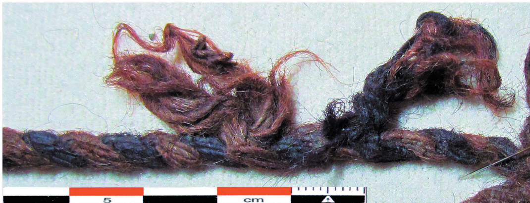
Figure 2. Two tufts of warp threads coming out of a loose cord. The tufts are the remains of the pile loop formed by one element of the cord.

The band can be woven with different tablet setups, which are always all threaded in the same direction. It is possible to use six-hole tablets, with two threads running through each of the holes. Also, it is possible to use four-hole tablets, with three threads running through each of the holes, or