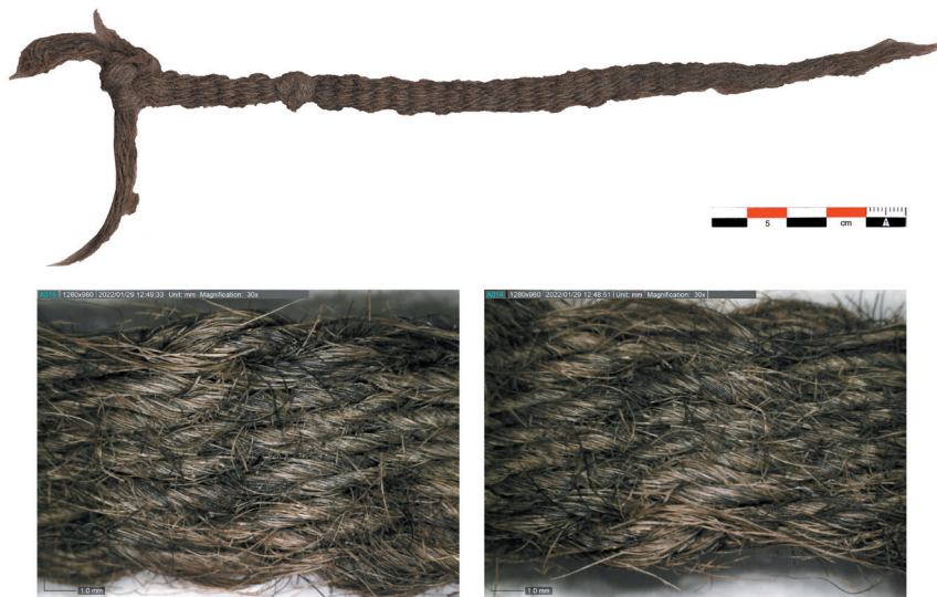
Figure 7. Blindis Inv. No. B 1396. Bottom: Microscope images (magnification 30x, Dino-Lite-Microscope. (Images: authors)

Both bands show distinct ridges on their surface, an effect created by the relatively thick weft thread that was used. The weft seems to be thicker in comparison to the warp in band B 1396, although less than in B 967, making the ridged effect in B 1396 more pronounced. The width of band B 1396 is irregular in some places. Both the irregular width and the fact that the weft was not beaten in to lie parallel in all places might all indicate that B 1396 was woven quickly and without much care.