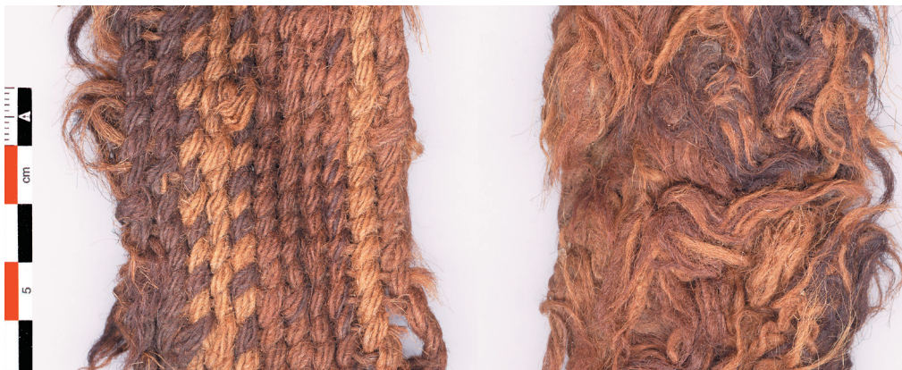
Figure 4. Closeup of B 1, showing pile threads and distortions on the back of the band.

There was no clear pattern of the pile looping discernible in our first examination of the band. With the matted and disordered state of the pile threads, making out where exactly the loops were pulled is very hard, and the distortions on the back of the band are not clear enough to tell from the back alone. In addition, the missing elements obscure the number of loops that were pulled from the corresponding tablet.