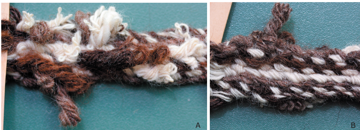
Figure 5. Test weave, showing looped pile on the front (A) and distortions of the cords on the back face (B).