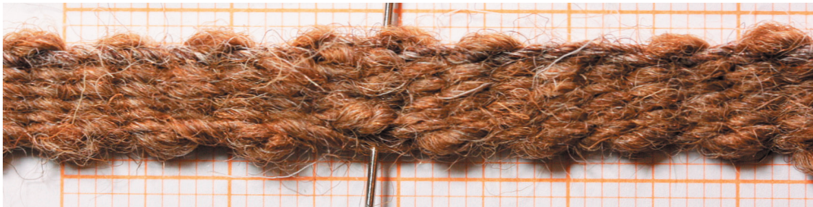
Figure 10. Test weave done with staggered tablets and 180° turns in both directions. Left half turn direction towards the band, right half turn direction away from the band. The pin in the middle marks the reverse of the turn direction.

If this were the case, this thread would form a very curious weaving fault. Not catching a warp thread in the correct shed is something that can occur when weaving; the missed thread then floats on top of the weave until the next regular change to the bottom of the shed. When weaving with heddles, this means the thread will float over three wefts. If the weaver catches the mistake and opts