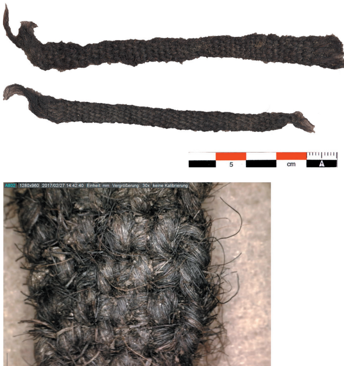
Figure 9. Blindis Inv. No. B 1168. Bottom: Microscope image, magnification 30x, Dino-Lite-Microscope.

The differences between threading through a single hole and through double holes were subtle, but using the double hole variation seemed to come a little closer to the look of the original. The method used was the following: all tablets were aligned so that the filled and empty holes alternated. All tablets were then turned 180° in the same direction before the weft thread was inserted. We focused on B 1396, and our test weaves were made with five tablets.