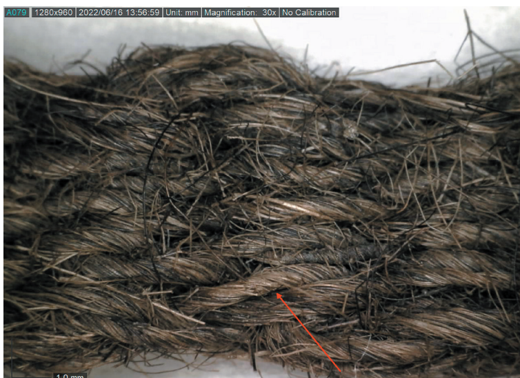
Figure 12. Microscope image of B 1396 showing the thread that appeared to stand out, indicated with a red arrow.

While the spectacular-looking, precious, patterned textiles do require a high amount of skill to make, the simple, more mundane cloth and its requirements on the workers' skills should not be