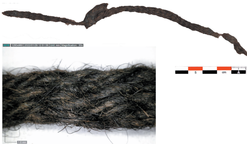
Figure 8. Blindis Inv. No. B 967. Bottom: Microscope image, magnification 30x, Dino-Lite-Microscope.