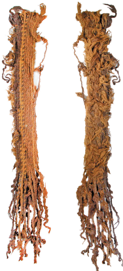
Figure 1. Band B 1.

The band structure is made using only two elements per tablet. Sometimes both elements in one tablet are the same