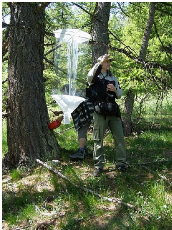
Setting up an interception trap

Research carried out by the teams is relatively easier to monitor and organise than individual research, although the two types of prospection are complementary.